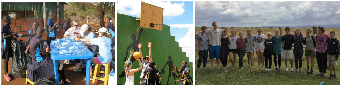
L to R: Rescue Center making the Eco Fence; Net Ball (not basketball, but kind of!); yes, that's elephants walking by the lodge here